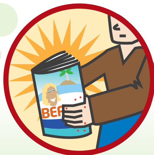
Dı̇ı nı̇ht'è wek'e naetse ha dı̇le

Dı̇ı wegondi gha, naxı̇ kı̇ta gots'ı̇ naı̇dik'ezhı̇ ts'adı̇ı gı̇ts'ı̇ gahde.